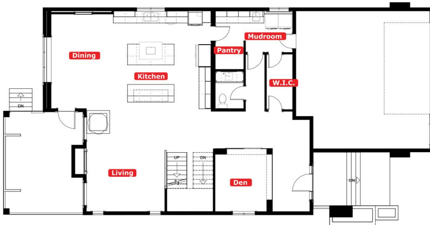
Main Floor 1,496 sq.ft.